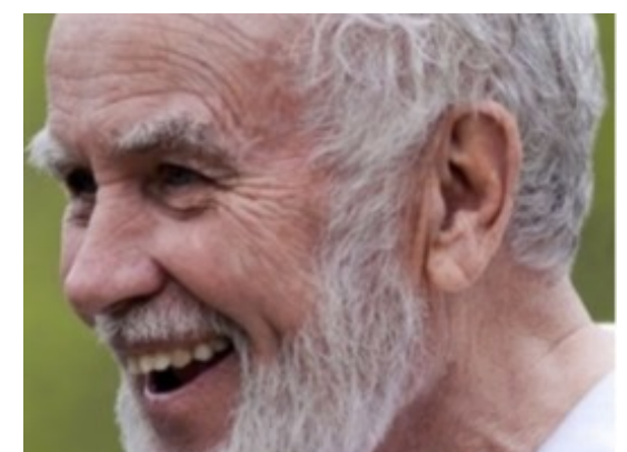
Own This Stock Before July 18th To Receive An Extra Dividend Payment Investors Alley