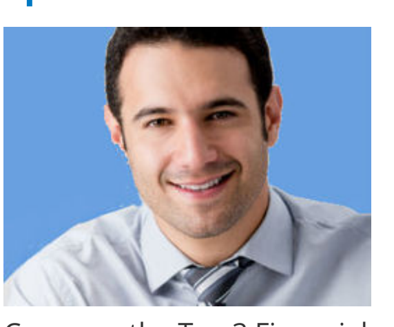
Compare the Top 3 Financial Advisors Near You WiserAdvisor