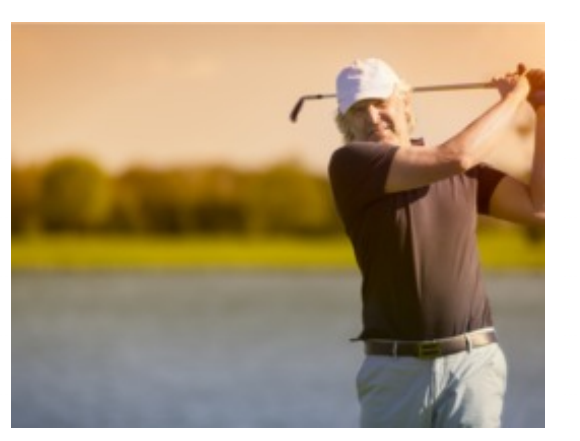
Buy and hold these 6 stocks to generate steady income in retirement.